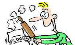
make a pizza