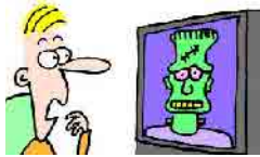
watch the film on TV