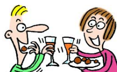
have a party