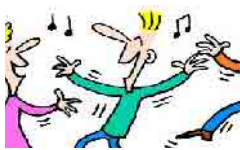
go to the disco

Teenager Can I go to the cinema? Parent Yes, you can. Teenager Can I buy a computer game? Parent No, you can't.