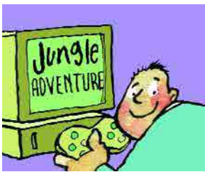
play this computer game