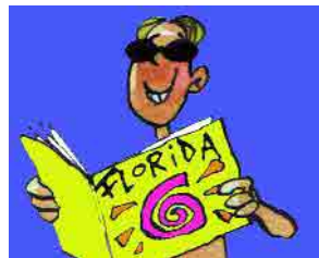
have a holiday in Florida with me