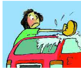
washing my mum's car