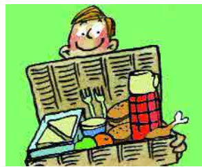
come to the picnic