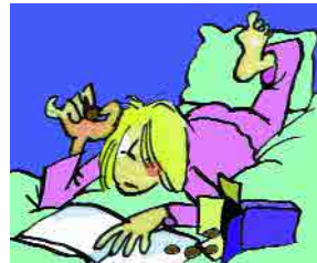
staying in bed