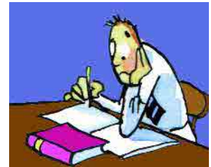
doing my homework