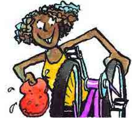
cleaning my bike