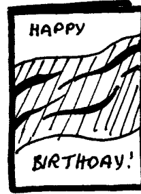
off both sides