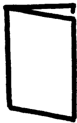
folded to A5

4 Show the class the simplest fold, which is to fold the card from A4 to A5. You might like to show additional folds.