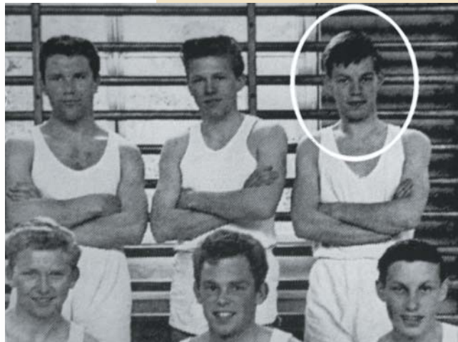
Mick Jagger in his school basketball team

He didn't use to do the homework – 'there was far too much' – and he was continually at war with the teachers. He used to break the rules all the time, especially rules he thought were stupid, about how to wear the school uniform and things like that. Once he even organized a mass protest against 'appalling' school dinners. 'It was probably the greatest contribution to school I ever made,' he said. Although he made a good start at school, Jagger said his school work deteriorated because of 'music and girls'.