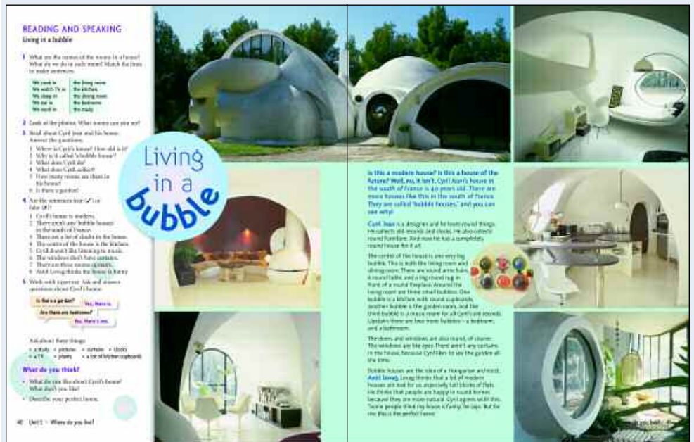
Reduced sample pages from New Headway Elementary Student's Book