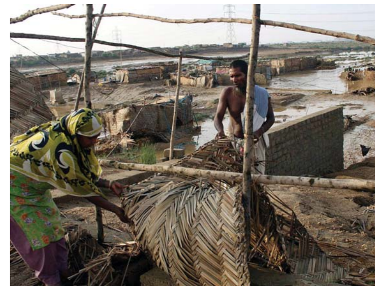
▲ Rebuilding a hut destroyed by floods in a Karachi shanty town in July 2007