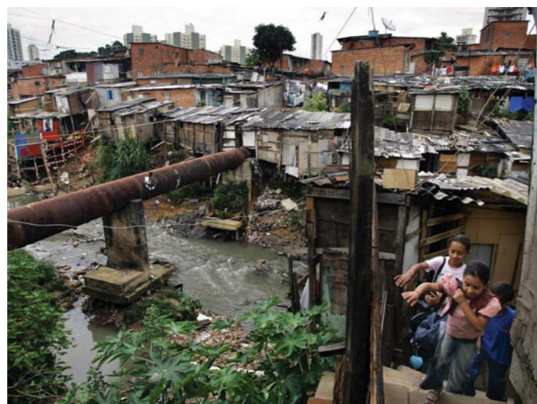
▼ Shanty dwellings in São Paulo, Brazil

In 2005, at least five people died in São Paulo's shanty towns (or favelas) after southern Brazil experienced some of its heaviest rainfall and flooding on record. The rain caused fatal mudslides. In 2007, flooding devastated South Asia. Residents from Karachi's shanty towns were evacuated as the badly built homes collapsed or were washed away by torrential rain. 200 people died.