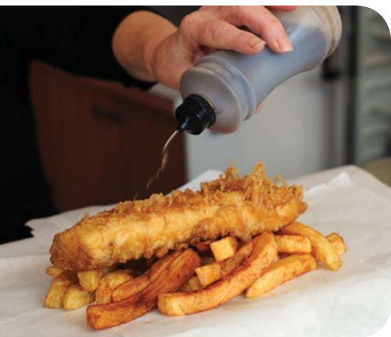
▲ Vinegar contains ethanoic acid, a weak acid

weak acid, strong acid, hydrogen ions, ionise, electrode, electrolysis, electrical conductivity