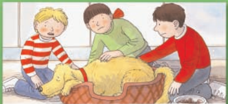
He lay on his bed.

Oxford Reading Tree stories have been written using a mix of high-frequency and phonic words which can be blended and sounded out, enabling your pupils to apply their phonic skills. The Stories also include high interest vocabulary which helps to develop children's language and comprehension.