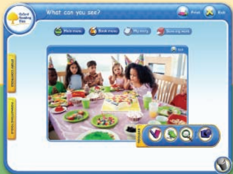
Sample screenshot from Oxford Reading Tree MagicPage Reception/P1 CD-ROM