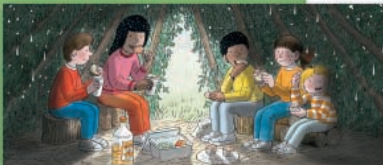
The children sat in the den but it began to rain.