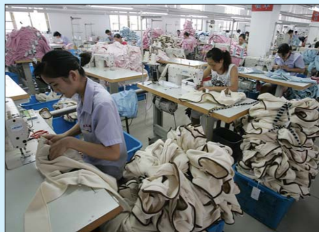
▲ China is the world's top manufacturer of clothing.