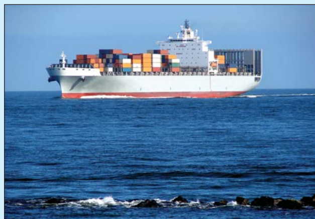
▲ On the way ...