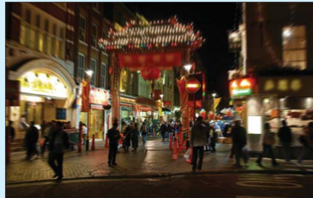
▲ London's Chinatown.