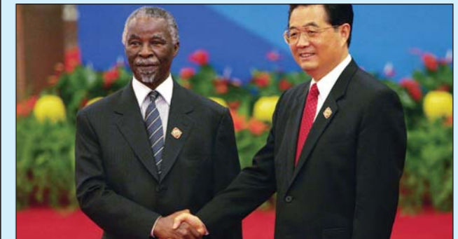
▲ China has invested in most countries in Africa.