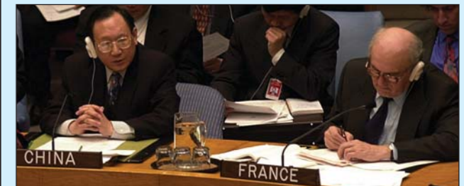
▲ At a United Nations Security Council meeting.