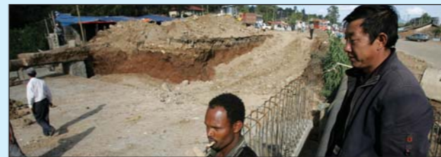
▲ A new road for Ethiopia in Africa, thanks to China.